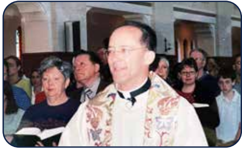
Celebrating 25th year as a diocesan priest in 2005

in this together as declared in our Parish Mission Statement: "We are the people of St. Christopher Catholic Church, a Eucharistic community of faith dedicated to Welcome, Celebrate, Care & Grow in the image and likeness of Jesus."