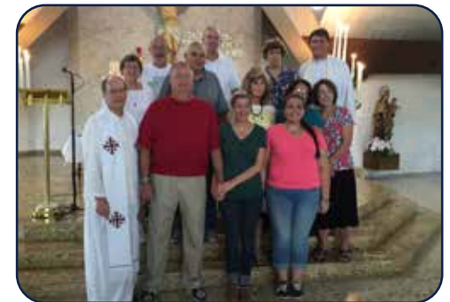
Mission trip to El Salvador 2015