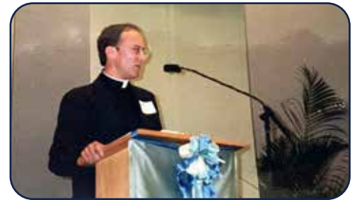
Dedication of the Parish Center in 2001