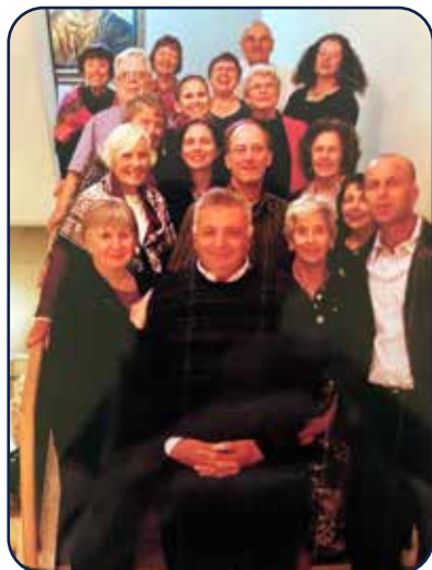
Holy Land pilgrimage in 2012