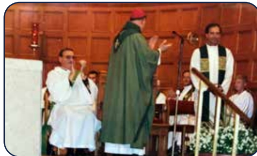
Installation as pastor in 1997