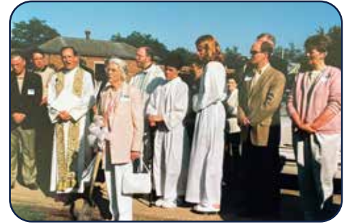
Breaking ground for the Parish Center in 2000