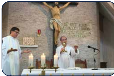
Mass in the Church of the Nativity in 2012