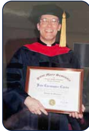
Receiving doctor in ministry in 2003