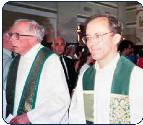
St. Christopher 75th anniversary in 1997