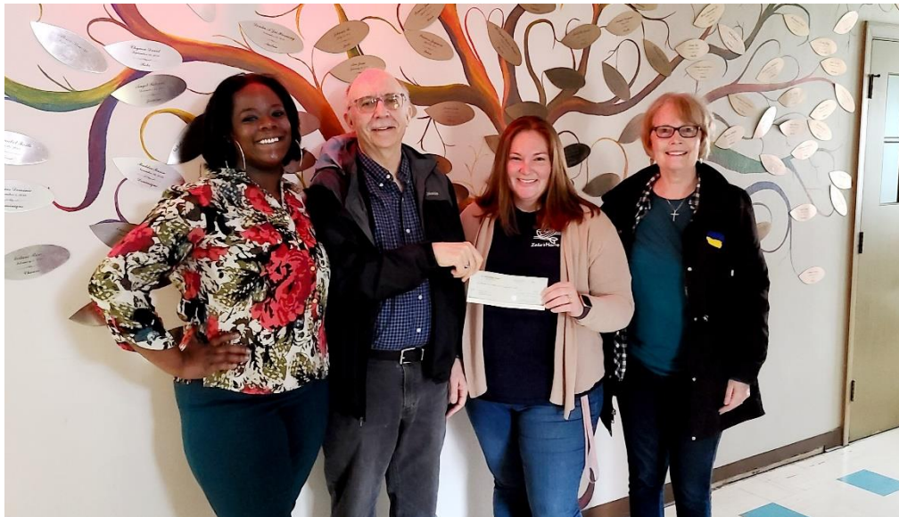
The check being presented to Zelie's Home. Thank you, St Christopher parishioners!