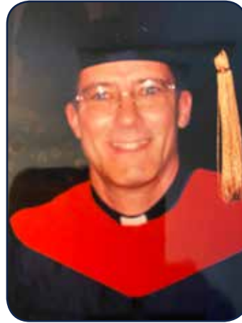
Receiving Doctor of Ministry degree