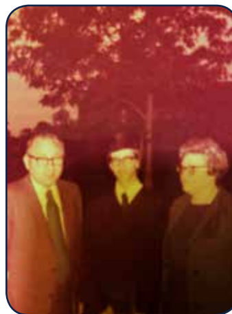
High School graduation