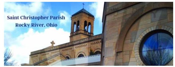
Saint Christopher Parish Rocky River, Ohio